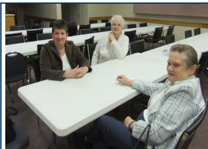
The ladies have cleared away their dishes and the table and take a few minutes to enjoy their meal.