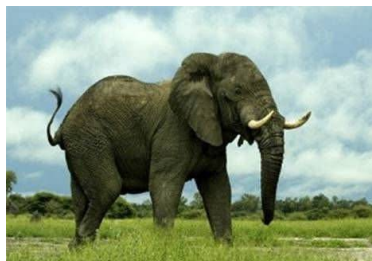
" A f r i c a n E l e p h a n t "