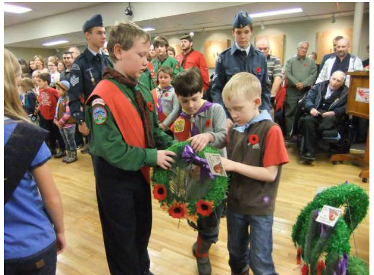
Many of the local groups and organizations were represented and wreaths were laid.

Father O'Malley rose from his bed one morning. It was a fine spring day in his new west Texas mission parish. He walked to the window of his bedroom to get a deep breath of the beautiful day outside. He then noticed there was a jackass lying dead in the middle of his front lawn. He promptly called the local police station.